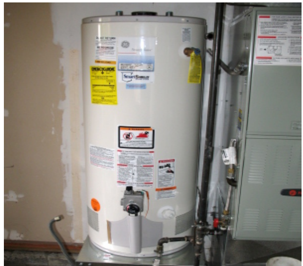
Traditional type hot water circulating system.