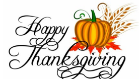
Russell Wiita Mayor, City of Sultan