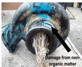
Damage from non-organic matter

Inaccurately touted as "flushable," disposable wipes and similar-style products cause severe problems at the city's wastewater treatment plant, including clogged pumps along with any other disposable wipe, paper towel, and rags. These clogs are costly, as they necessitate emergency repairs by city maintenance staff. Every time a clog occurs, the plant is forced to shut down as our operators remove these disposable rags by hand. Thank you for keeping these products out of the sewer system!