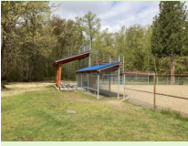
Completion of Osprey Park Baseball Field improvements

Working on a future parking lot behind City Hall